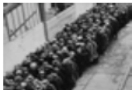
Out of work